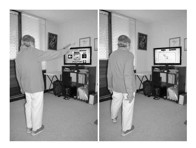
Figure 1: A participant interacting the main menu in Step-Kinnection (left) and playing one of the stepping tasks (right).

Research by Yau et al. [2013] showed strength and power exercises were a good strategy to counterbalance the loss of muscle